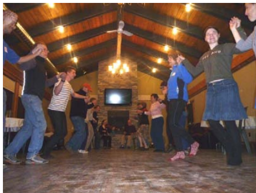
Dancers at the Irish Ceili, one of many favorite activities at the Paddle Conference