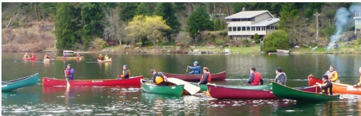
Having Fun on the Water at the Paddle Conference in Hope.